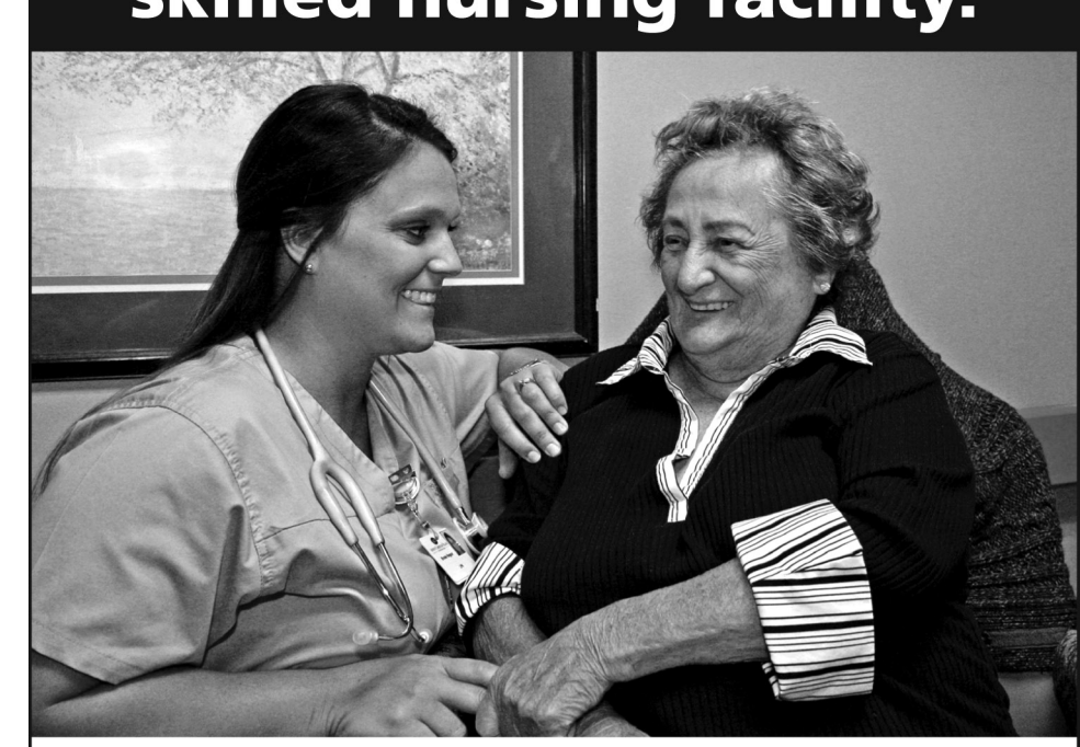
Valid FL nursing license required.

To apply: Visit www.acvillage.net/jobs to download an application or visit the Personnel Office at 10680 Dowling Park Drive in Dowling Park to fill out an application. Call (386) 658-5592 to inquire about the application process.