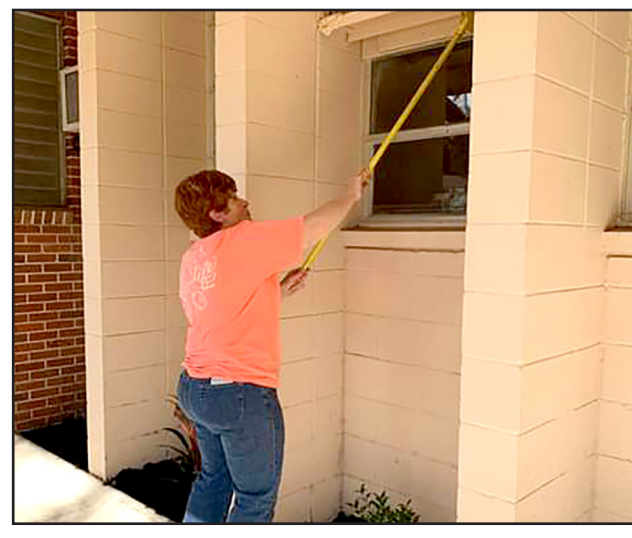
Volunteers cleaned out and replanted flower beds at the Taylor Senior Citizens Center during Taylor County United Way's 'Day of Caring.'