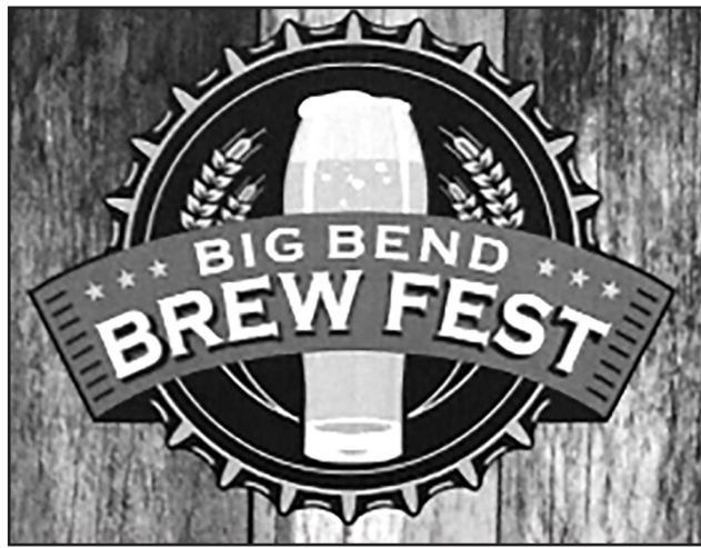
The 2nd Annual Big Bend Brewfest, originally scheduled for Saturday, March 2, has been postponed until Saturday, March 16.

The Big Bend Brewfest is a Rotary Club of Perry event that offers unlimited tastings of different beers to raise funds to donate to the Perry Police Department's "Shop With