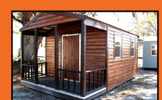
12X20 PORCH MODEL