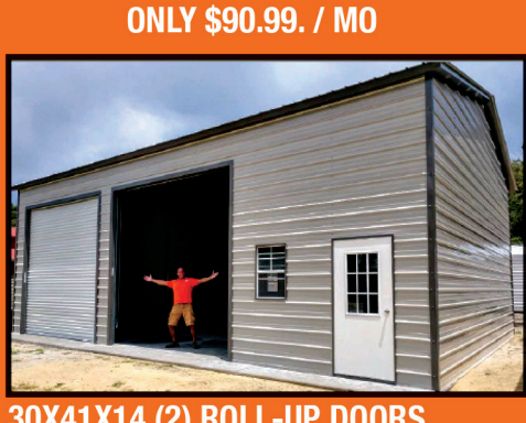
30X41X14 (2) ROLL-UP DOORS