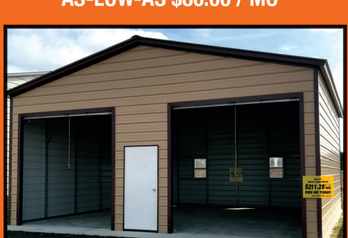
28X31 (2) ROLL-UP DOORS (1) WALK-IN DOOR (2) WINDOWS ONLY $211.28 / MO