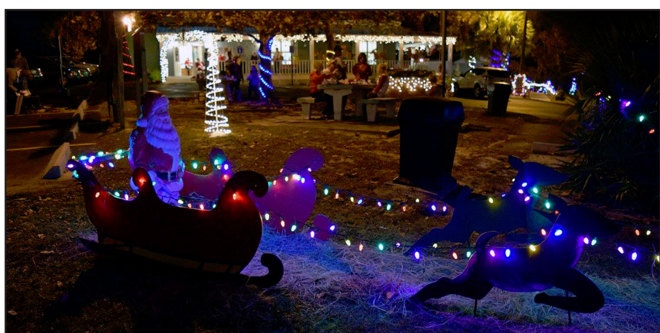
From 6 to 7:30 p.m. on Saturday, the Steinhatchee Community Center will be the site of the annual "Christmas in the Park." Those in attendance will be treated to hotdogs, cocoa and a visit with Santa Claus.