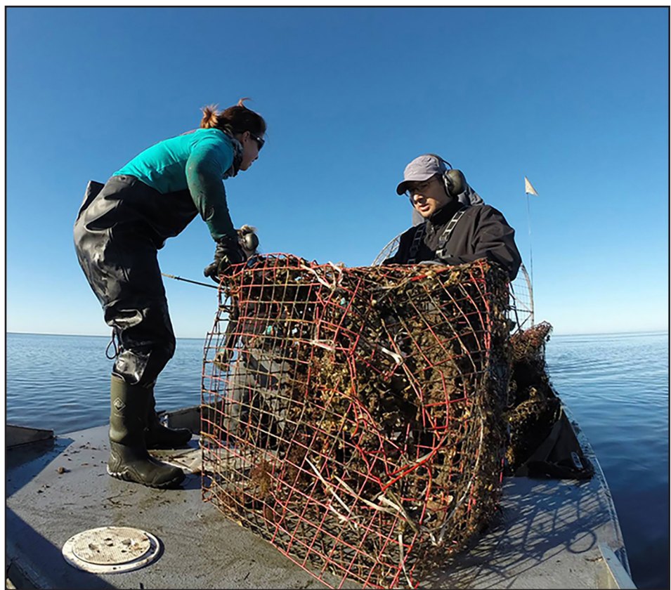
According to the Florida Department of Environmental Protection, a total of 206 traps were removed from Deadman's Bay in 2017 and a total of 238 traps in 2019.

For more information, contact the Victor Blanco at the Taylor County Extension Office at (850) 838-3508 or victorblancomar@ufl.edu.