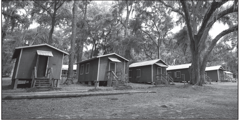
Since it opened in 1937, Camp Cherry Lake has hosted thousands of youth. The 4-H camping program helps youth find confidence and independence in a safe, fun environment.

If you or your organization would like to discuss partnering with 4-H, please contact Cayli Hilton at grow4h@ifas.ufl.edu or (352) 392-5432.