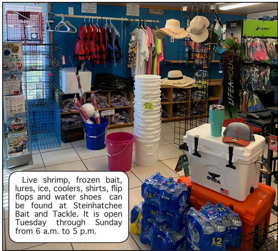
Live shrimp, frozen bait, lures, ice, coolers, shirts, flip flops and water shoes can be found at Steinhatchee Bait and Tackle. It is open Tuesday through Sunday from 6 a.m. to 5 p.m.