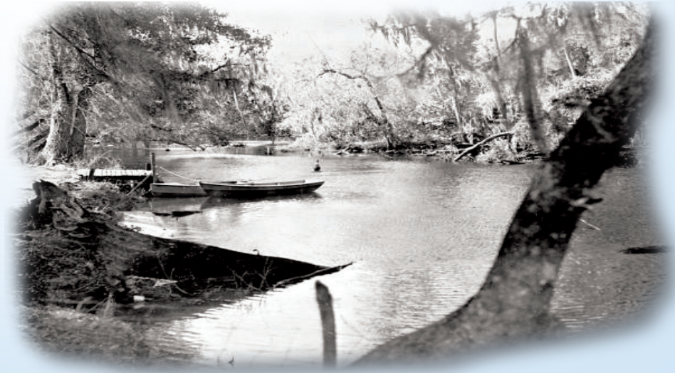
View of boats at a fishing camp - Aucilla River, Florida.