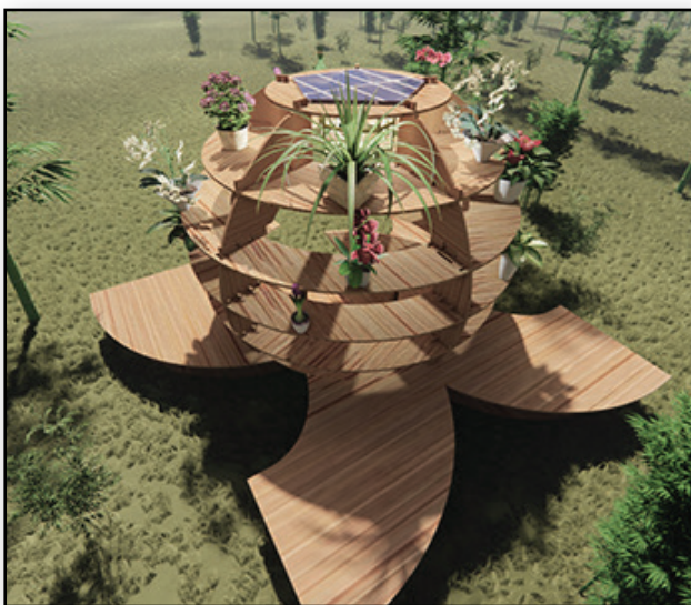
The top of the EcoDome has solar panels that would be efficient enough to power the LED light fixture as well as the irrigation system.

“I did not really know how to showcase the irrigation system without it taking a ton of time, but I will explain what I had in mind: Underneath of base E through G, a timed sprinkler system (through a network of wires) would go off every now and then to water the potted plants located on bases D through F.