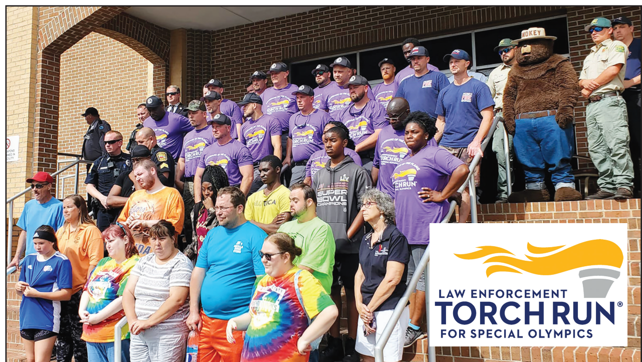
The Taylor County Special Olympics Torch Run, which traveled through downtown Perry on Monday, concluded at the Taylor County Courthouse, where local athletes, law enforcement members and first responders were recognized, before being treated to lunch at Hardee’s.

Coordinators deemed the event a huge success and “much more fun for the runners and athletes than the ‘virtual runs’ that were held the past two years.”