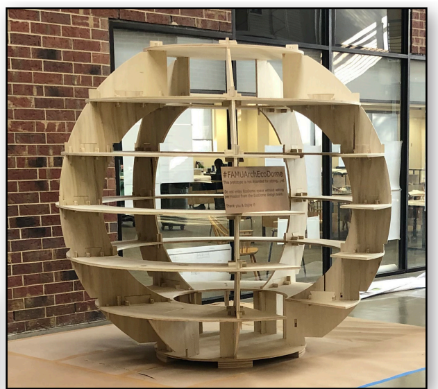
This is a full-scale mock-up of the EcoDome pavilion in the FAMU architecture building.