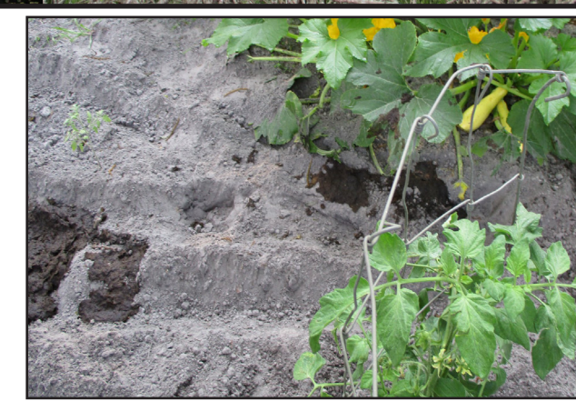
I left the barnyard gate open and a cow got in the garden, did some fertilizing!

I fixed the leg on this salvaged bench (below) -