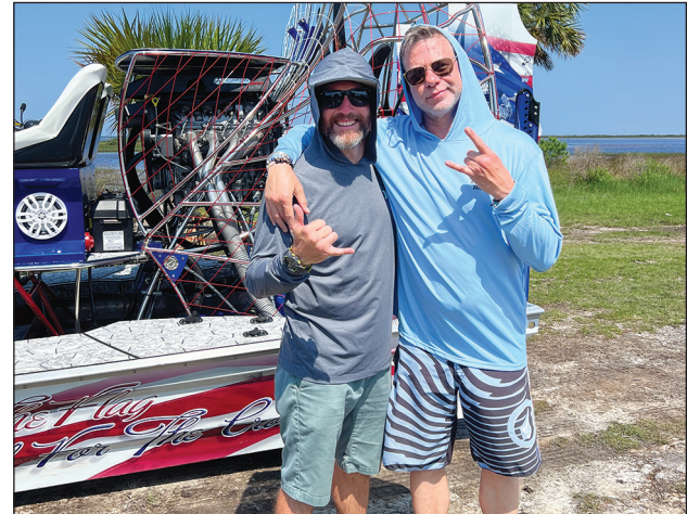
Episodes of "Lost In..." will air on Destination America on back-to-back Thursdays, Oct. 26, and Nov. 2.