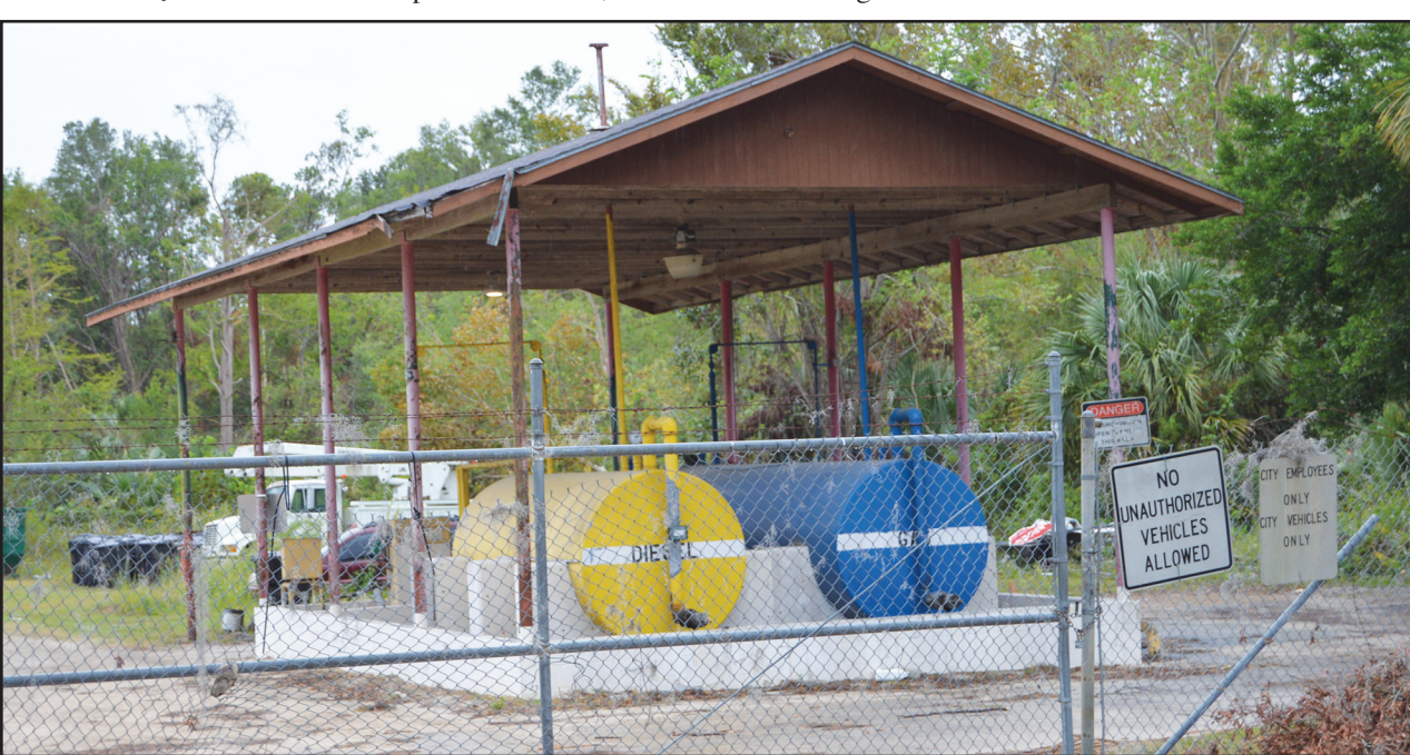
The city's fuel depot will soon be upgraded to an automated system that will help track usage and notify staff when fuel levels are low.