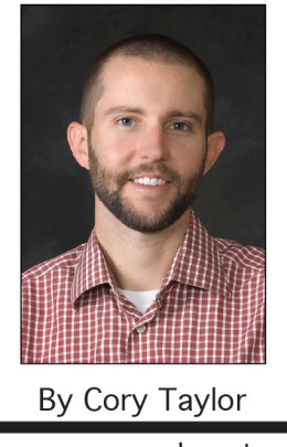
By Cory Taylor

but many people choose international mutual funds or international exchange-traded funds (ETFs), which can be traded like stocks and track a specific market index. It's also possible to invest in bonds issued by foreign governments or entities. However, investors should typically focus on diversified funds and ETFs for international exposure in their portfolios.