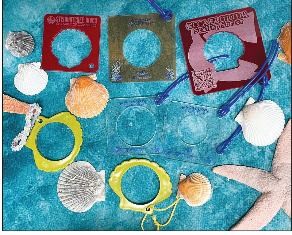
Taylor County Extension Office officials encourage those planning to harvest scallops this season to use "scallop sorters" to ensure smaller scallops are returned to the Gulf and given a chance to grow and maintain a health resource for future seasons. Free sorters will be given out at a Scallop Seminar planned for Friday, June 12, at the Steinhatchee Community Center.

with a big rematch against Chiefland -- the only team to hand them a loss in the regular season last year. The Indians went 11-2 in 2025, rolling to the state Class 1R (Rural) semifinals before falling to eventual state champions Hawthorne, 36-6. Hawthorne defeated Blountstown 24-8 to win the Class 1R-Rural state championship. Chiefland lost only once in the regular season (14-0 to Baker County), reeling off wins over Williston (36-35), Belleview (21-14), Lafayette (41-14), Trinity Catholic (42-14), Trenton (41-0), Dixie County (63-8), Taylor County (30-15), Keystone Heights (42-7), Union County (42-0), Sneads (44-6) and Baker (49-19).